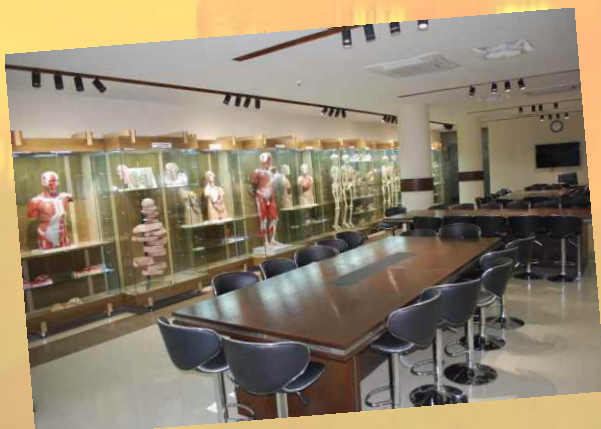
The anatomy museum FUMC, after renovation